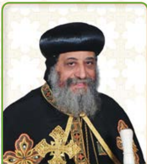
H.H. Pope Tawadros II

Pope of Alexandria & Patriarch of the See of St. Mark